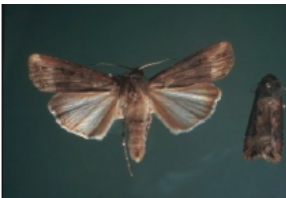
Figure 1. Fall armyworm moths.